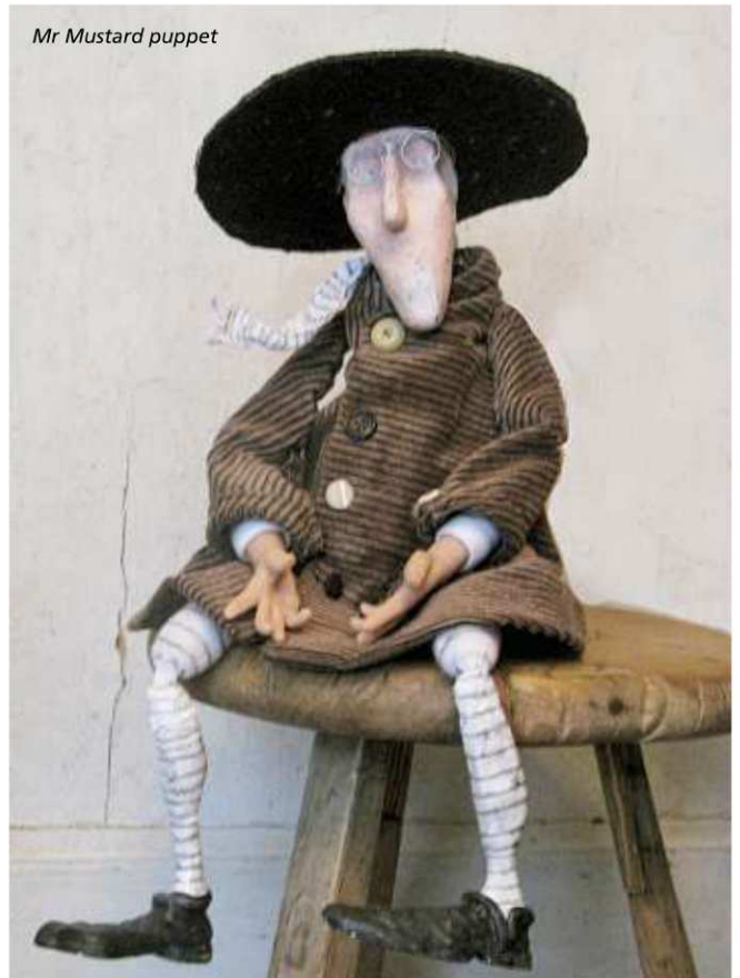
Mr Mustard puppet