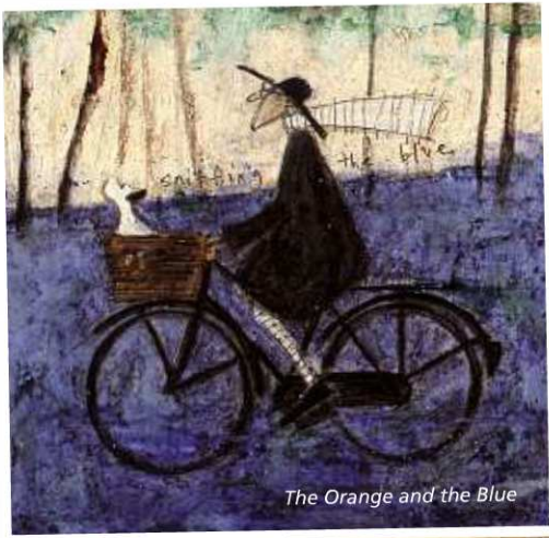
The Orange and the Blue