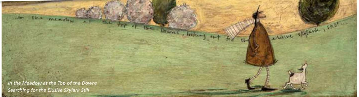
In the Meadow at the Top of the Downs Searching for the Elusive Skylark Still

from craft courses at West Dean College, which have helped transform them into puppets and even sculptures.